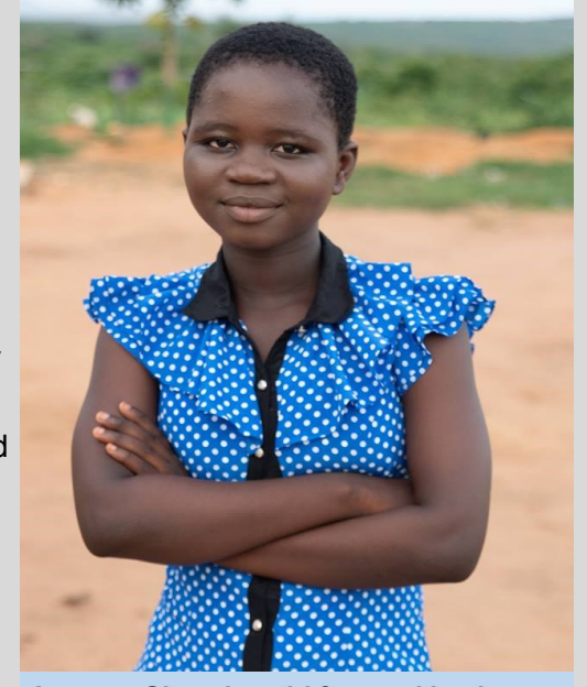
A young Ghanaian girl featured in the documentary film

The Village Projects' organizational mission is "To create environments in which persons from diverse circumstances and experiences can come together and co-learn with each other in a way that bridges the opportunity gaps, retains the respective cultures, and ultimately benefits