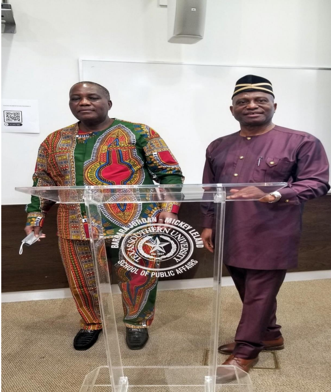
@Liberia Bicentennial 1822-2022 (The Land of Return) Commemorating 200 Years of Freedom and Pan-African Leadership on Saturday, February 26, 2022