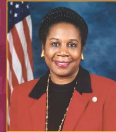
CONGRESSWOMAN SHEILA JACKSON LEE Legislative Symposium