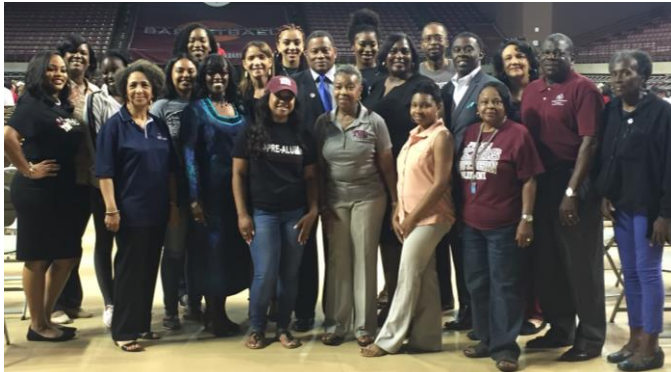
Shown above are TSU Alumni and Pre-Alumni members who volunteered to help with the pre-commencement activities. At right is a collage of TSU Spring 2016 graduates.

The youngest graduate was 20 years old and the oldest was 82.