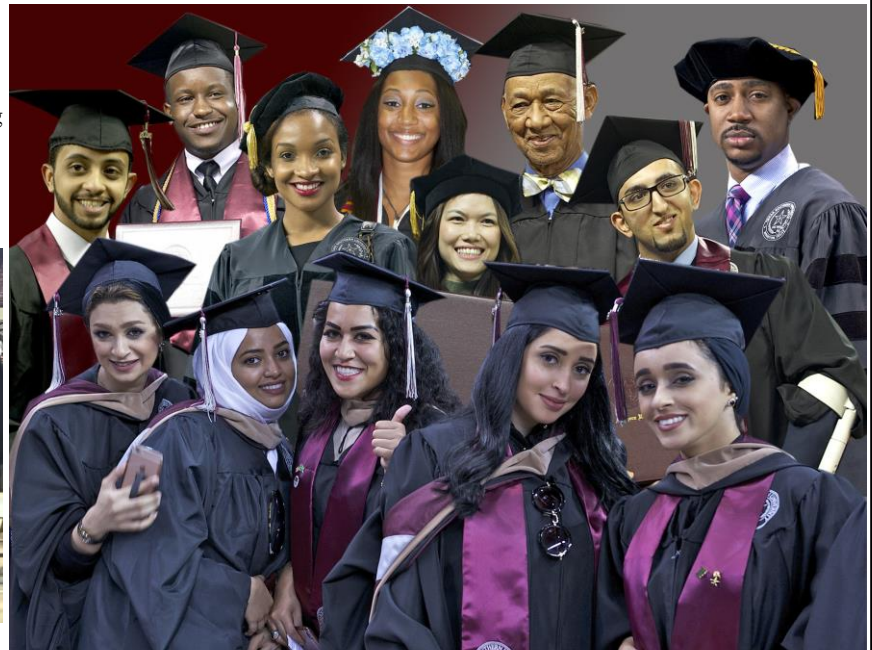
Texas Southern Congratulates its 2016 Spring Class