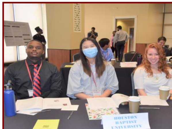
Participants from Houston Baptist University