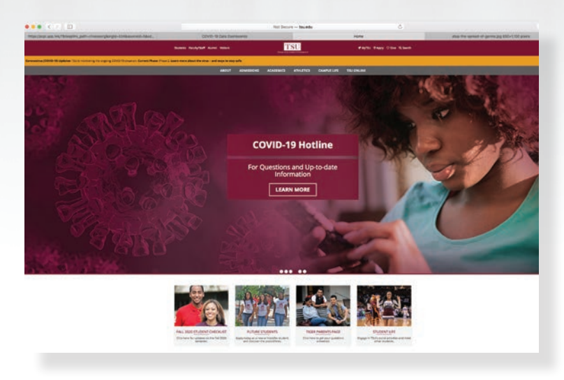
Texas Southern University COVID-19 Information