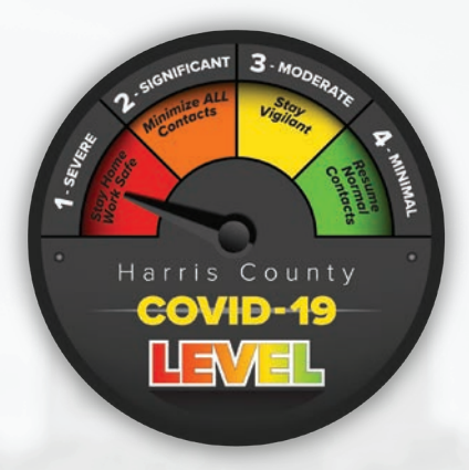
Harris County Public Health

The University will communicate with students through their Texas Southern University email accounts. Please check your email account on a consistent basis for guidance and updates. In addition to your Texas Southern University email account, important information can be found on the following websites: